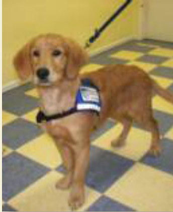
Parker is a Golden Retriever pup who is eager to please and loves learning at Brigadoon. He is looking for a sponsor who loves Retrievers.

We are busy training puppies and young dogs which are slated to graduate in 2011 or 2012. It costs up to $30,000 to raise, train, and house a dog from a puppy and we are looking for sponsorship(s) for each dog. If you are interested in sponsoring a dog please see our website at http://www.brigadoondogs.com/Sponsor-A-Dog.html to pick a level of sponsorship that works for you, or call us at 360-733-5388.