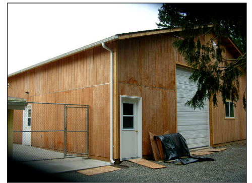
The Brigadoon training building is complete. Look for future information on a work party to paint the exterior.

A new 1,584 square foot, training building was added to the Brigadoon facility in November. The new building provides plenty of space to have more than one dog being trained at a time. Brigadoon will be offering basic obedience training and puppy training to the public. If you and your dog are interested in the classes please call Denise CoStanten at 360-733-5388.