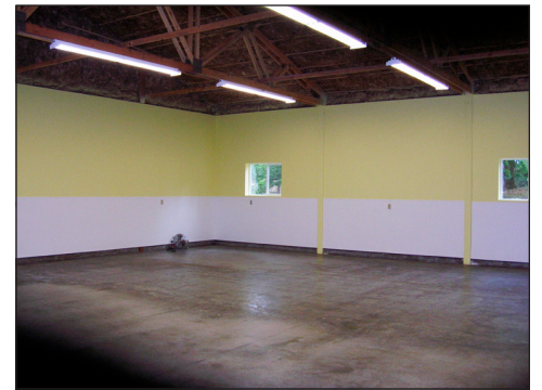
The heated interior of the training building is ready to use. The false ceiling and matted flooring will be added later. The trainers started using the building mid-February.