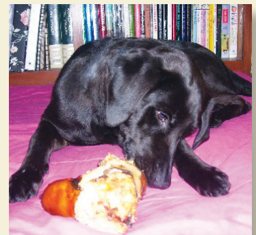
Gracie, came to us from the Puyallup Animal Shelter. She is a Black Lab that enjoys an occasional bone during her 'off' time. When she isn't chewing on her bone she is busy studying the commands of her trainers. Sponsor Gracie and she might share the bone.